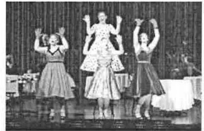
A scene from "Café Variations"

It may not be to everyone's tastes: unlike the new-styled Gershwin shows (such as the shows mentioned above and hits like "My One and Only" and "Crazy for You") that rework the shows the brothers wrote in the 1920s and 1930s, "Café Variations" doesn't offer old-fashioned musical-comedy. Nor does it have much of a narrative at all. Instead what director Anne Bogart has done is take playlets by her long-time collaborator Charles Mee and informed them with songs and musical interludes by the Gershwins. Set in what appears to be a cafe in an upscale hotel, it takes Mee's short scenes and gives them a "Grand Hotel" treatment: vignettes whose connecting tissue is the subject of romance.