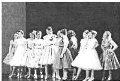
A scene from "Café Variations"