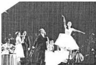
A scene from "Café Variations"