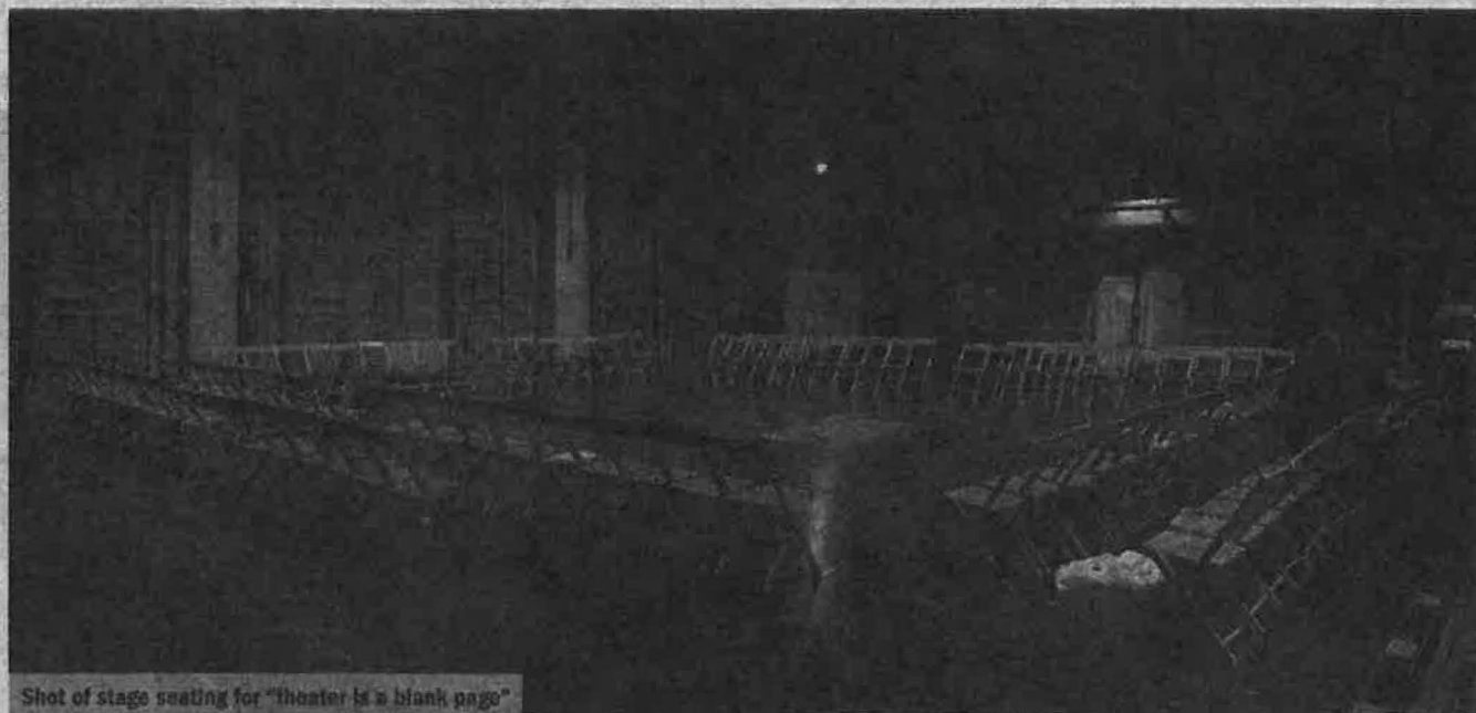
Shot of stage seating for "theater is a blank page"