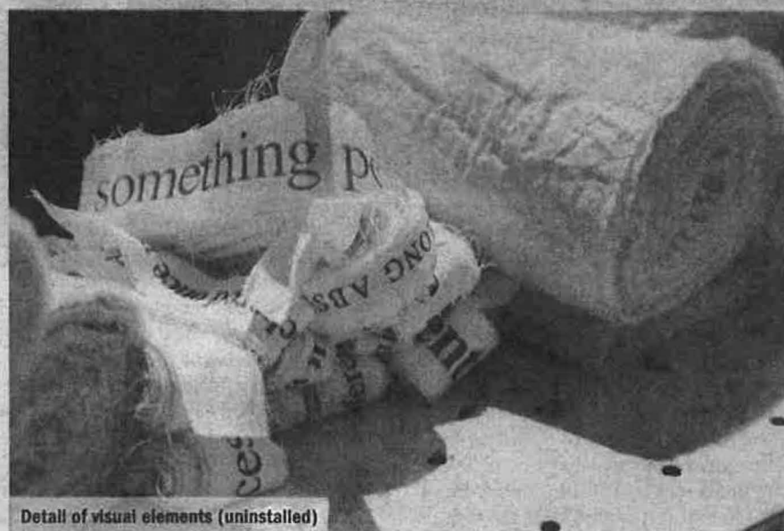
Detail of visual elements (uninstalled)

the thread" blended together readings, sound and live elements (involving SITI Company members) within a field of swings for visitors to participate and connect to the action of each other and the work itself.