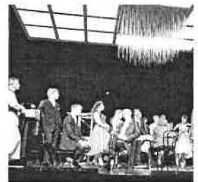
The cast of 'Café Variations' rehearces the Boston Globe show.

At no point will a character send circular saw blades spiraling through the air. There will be no wild frenzy of tossing, tearing, and breaking that leaves the set in ruins. No one will hook anyone's body up to a car battery. And never will a soldier walk into a Norman Rockwell moment and jolt the proceedings with a monologue about the ugliness of war.