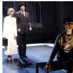
Death and the Ploughman (Photo by - handout)