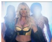
7 Banned Music Videos That You Can Watch Now Red Bull