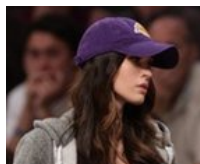
How to Wear a Baseball Cap and Look Cool—Not Klutzy Luckv