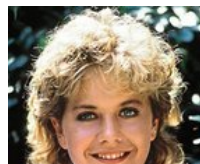
Stunning Celebrity Style Transformation: Meg Ryan www.instvle.com

6. Diane Disney Miller, daughter of Walt, dies at 79