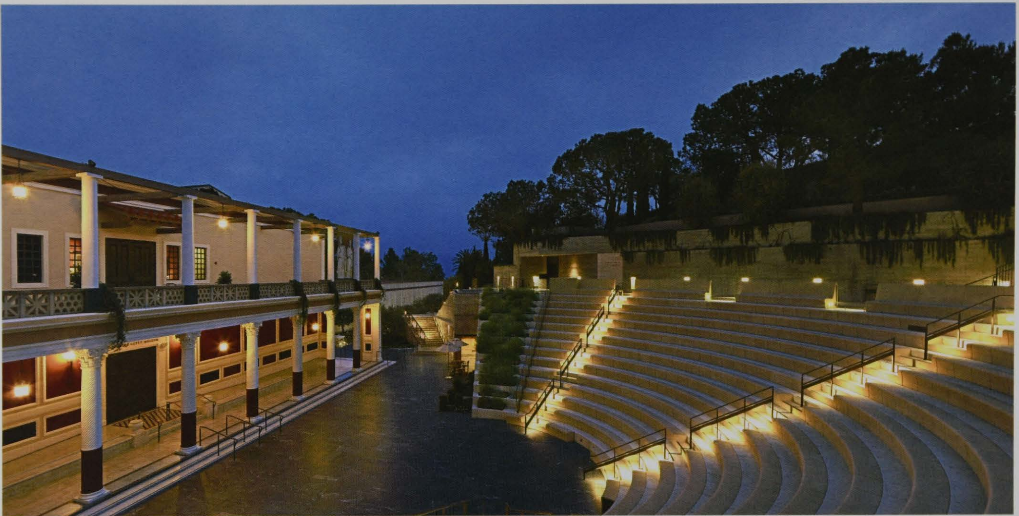
View of the Barbara and Lawrence Fleischman Theater and the entrance of the J. Paul Getty Museum at the Getty Villa.

The performance is approximately ninety minutes long. There is no intermission.