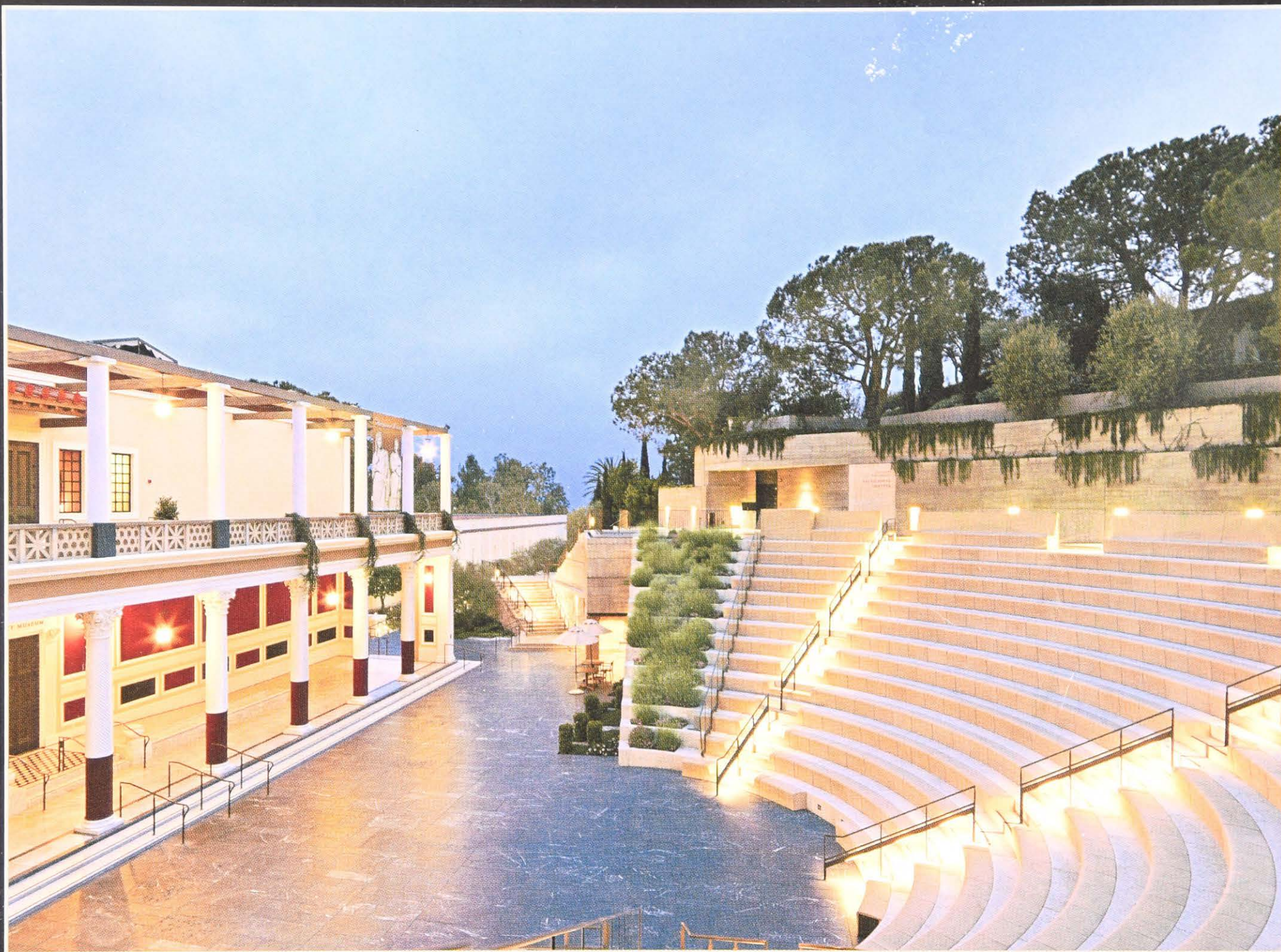
View of the Barbara and Lawrence Fleischman Theater and the entrance of the J. Paul Getty Museum at the Getty Villa

The performance is approximately ninety minutes long, without intermission.