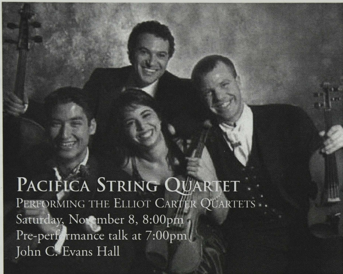
PACIFICA STRING QUARTET PERFORMING THE ELLIOT CARTER QUARTETS Saturday, November 8, 8:00pm Pre-performance talk at 7:00pm John C. Evans Hall