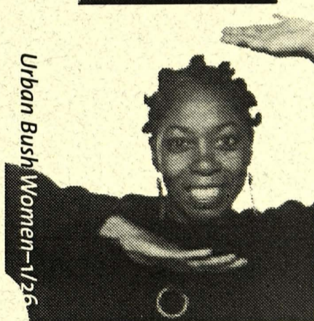
Urban Bush Women-1/26