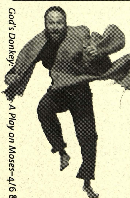
God's Donkey: A Play on Moses-4/6 & 7